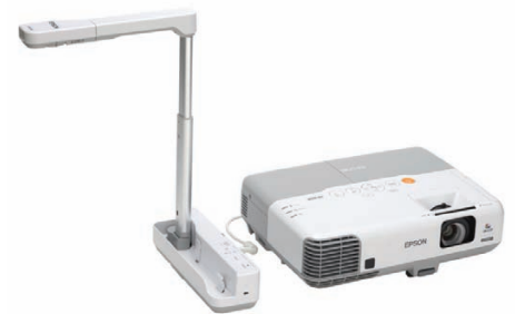
Share 3D objects using the ELP-DC06 document camera